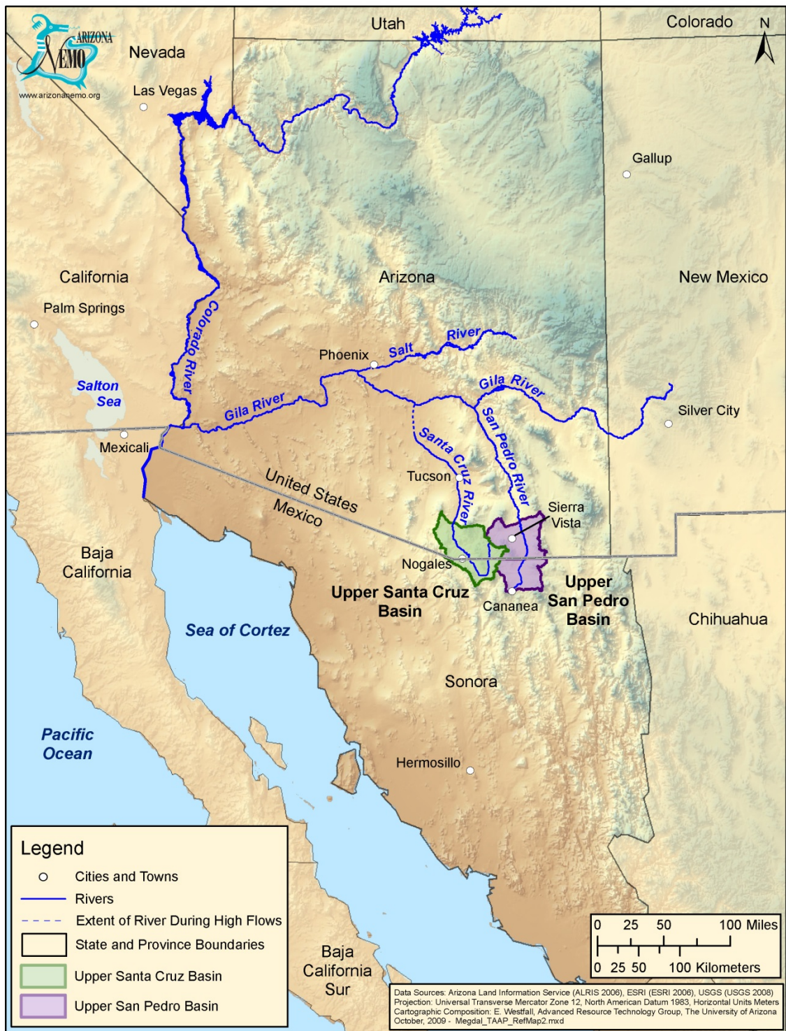
Figure 1. Locations of Upper Santa Cruz and Upper San Pedro River Basins (adapted from Megdal and Scott, 2011).